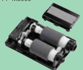
Paper Feed Kit for MP Tray PF-M5000