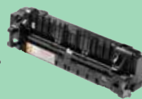
Fuser Unit FD-5000