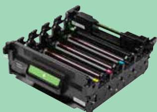
Drum Unit DR665CLP