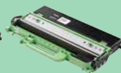
Waste Toner Box WT229CL